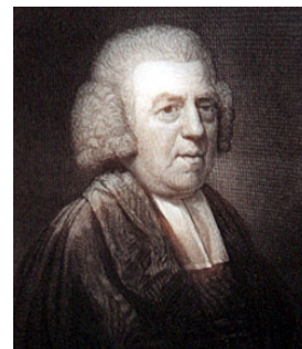
John Newton 1725-1807

" Amazing grace , how sweet the sound..." So begins one of the most beloved hymns of all times, a staple in the hymnals of many denominations, New Britain or "45 on the top" in Sacred Harp . The author of the words was John Newton, the self-proclaimed wretch who once was lost but then was found, saved by amazing grace. Newton was born in London July 24, 1725, the son of a commander of a merchant